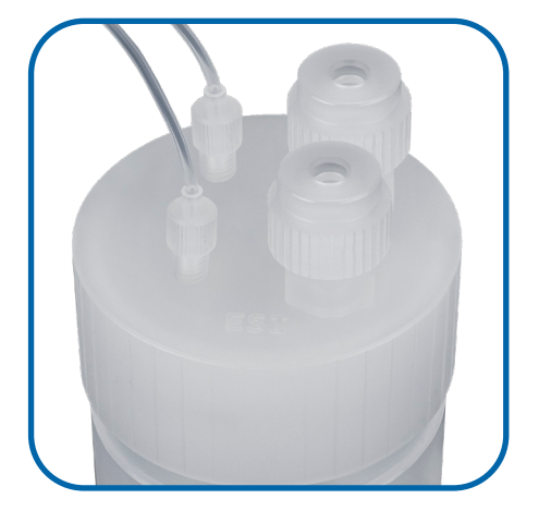
pergo 500 Dual Channel humifies both the nebulizer gas and the HMI/UHMI gas flows