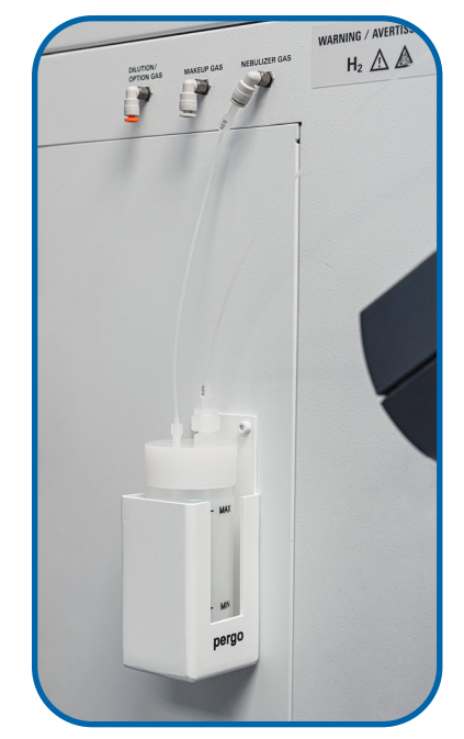
Agilent 7900 with the pergo 500 Argon Gas Humidifier

The pergo 500 Dual Channel adds a second channel to humidify the HMI/UHMI gas flow. This enhances performance and long-term stability when high solids samples are analyzed when utilizing HMI/UHMI. With the pergo 500 Dual Channel, both the nebulizer and the HMI/UMHI gas streams are humidified.