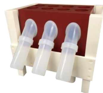
CleanAcids 3-125 mL