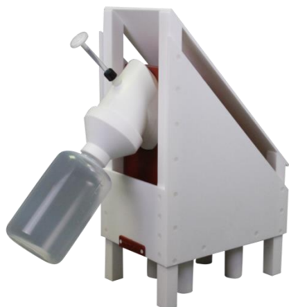
CleanAcids 1000 mL

Purification system designed to obtain extra pure reagents from standard quality acids, essential for trace and ultra-trace analysis.