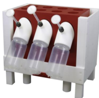
CleanAcids 3-500 mL