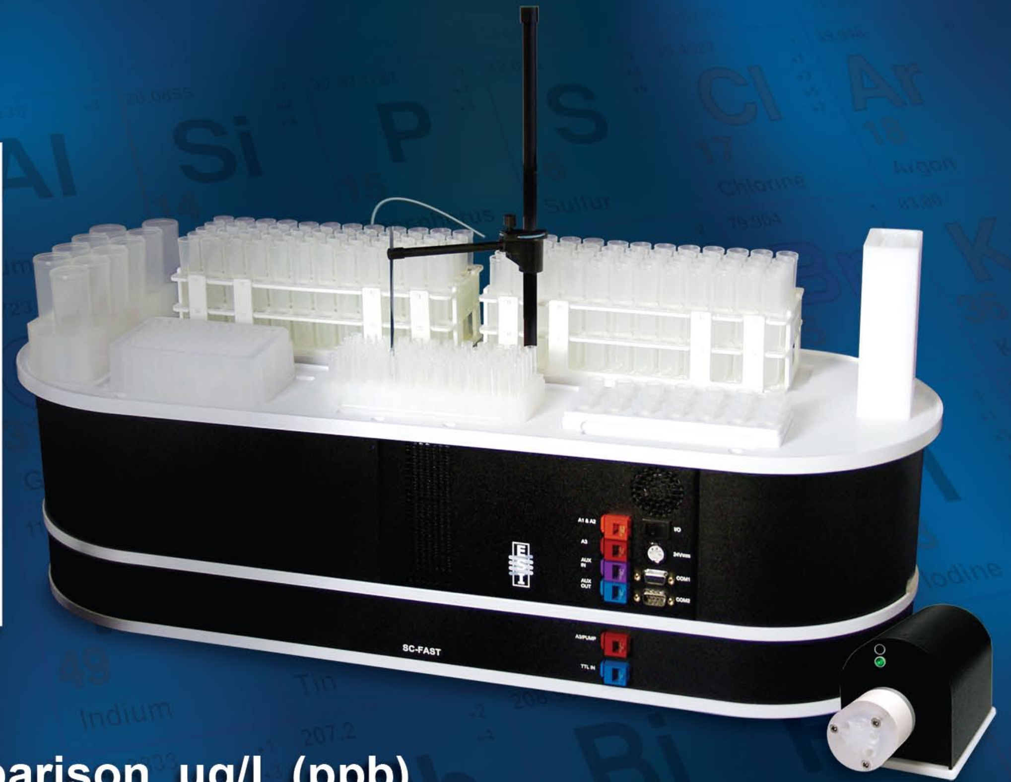
EPA 200.7 MDL Comparison, \mu\text{g/L} (ppb)