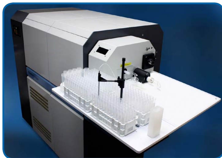
SC-E4 FAST Autosampler with Dual Flowing Rinse