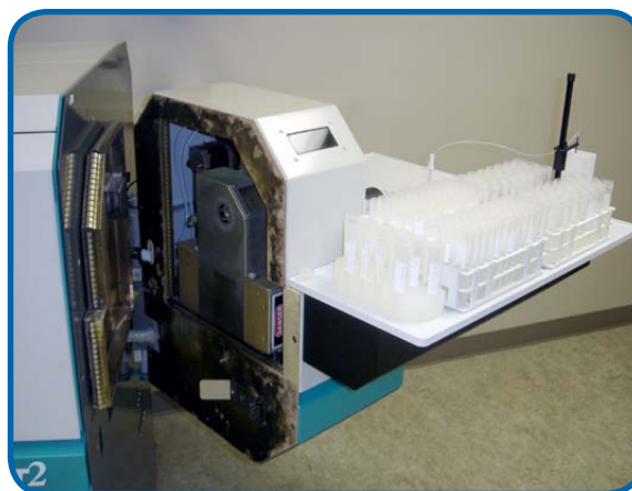
SC-E4 Moves with ELEMENT 2 door to easily replace cones without removing the autosampler.