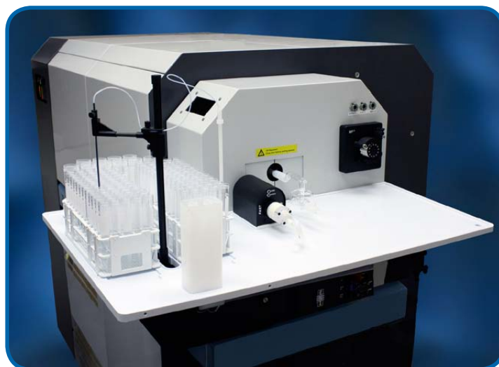
SC-E2 FAST Autosampler with Dual Flowing Rinse