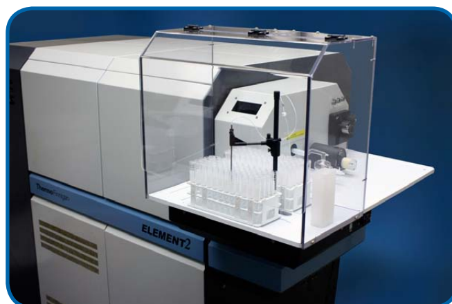
SC-E2 Enclosure on Thermo ELEMENT 2

ULPA filter side plate available upon request for either the right or left side of the SC-E2 enclosure