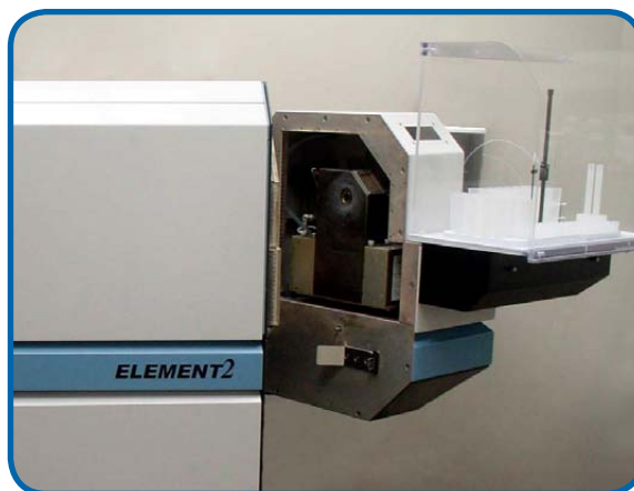
SC-E2 Moves with ELEMENT 2 door to easily replace cones without removing the autosampler.