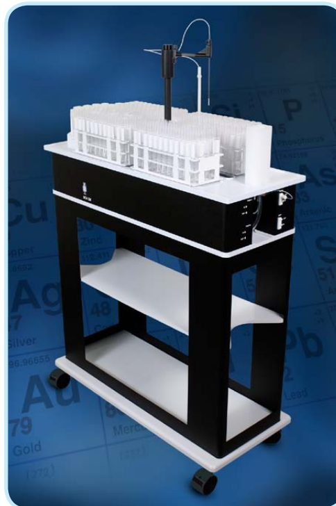
SC-4 DX on Mobile Stand