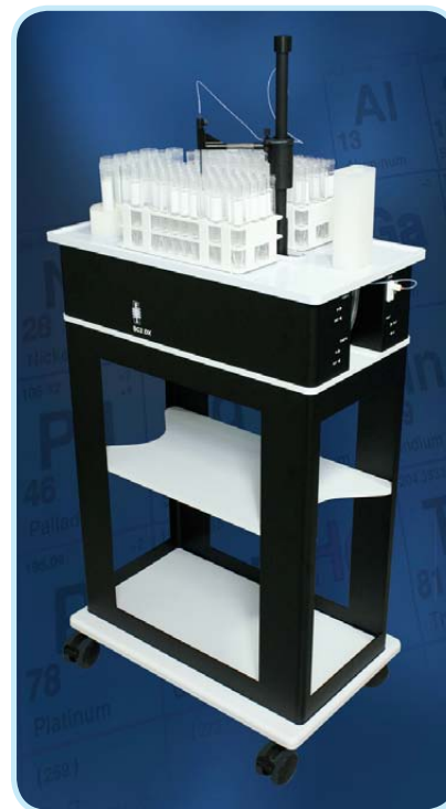
SC-2 DX on Mobile Stand