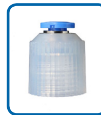
F4-54 NexION/ELAN Nebulizer Gas Quick Connect