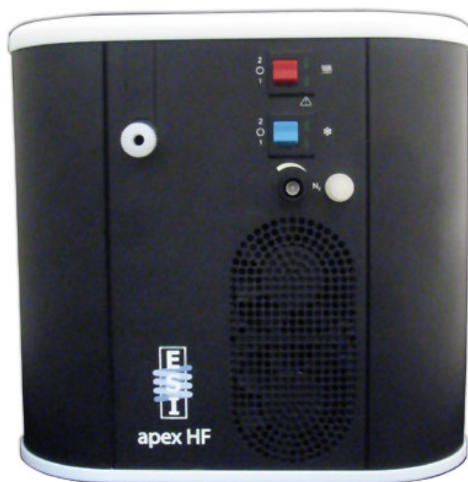
Apex HF high efficiency inlet system