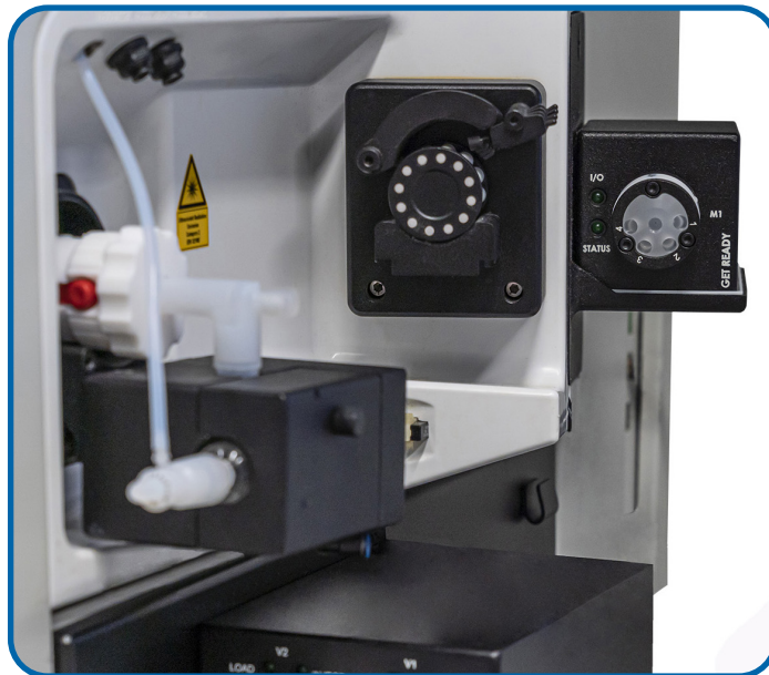
GetReady installed on iCAP™ RQ. GetReady can be used with FAST or prepFAST

GetReady automatically performs unattended daily tuning functions through Qtegra™ on the iCAP™ Q/RQ/TQ ICPMS. Daily tune, mass calibration, and detector calibrations can be performed without the need for manual introduction of the required solutions. GetReady bottles are capped to prevent evaporation and contamination.