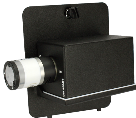
GetReady selection valve and rack support quick and simple installation