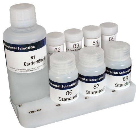
SmartTuner multielement calibration