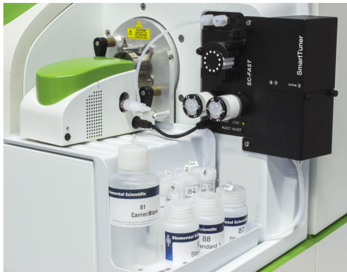
SmartTuner with prepFAST valve system and PerkinElmer NexION 350

SmartTuner valve system with PerkinElmer NexION 2000